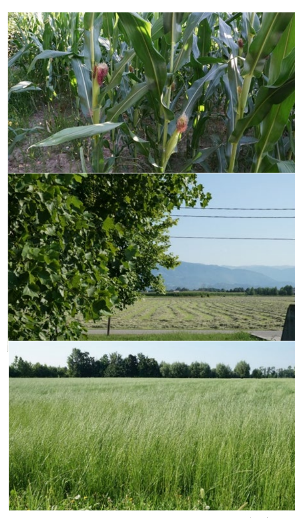
The three main feeding systems are based on maize (top), cereals other than maize/hays (middle) and permanent meadow for hay (bottom).

Much research has focused on assessing the finer details of milk composition, to identify bioactive compounds as potentially useful markers of milk origin. This includes a study of the unique chemical fingerprints left by specific cellular metabolic processes - a metabolomics approach. This promising method provides a detailed picture of food composition, allowing simultaneous characterisation of many compounds in complex biological matrices and is proving useful as a rapid, accurate tool for milk authentication. More recently, DART-HRMS has been developed, coupling two cutting-edge analytical techniques (Direct Analysis in Real Time and High