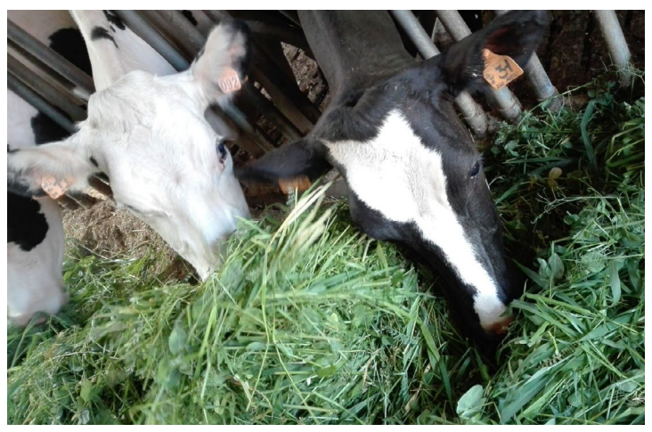
Cow's diet affects milk metabolomic profile.